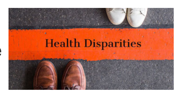
August 7-11, 2023 NIH Campus - Bethesda, MD