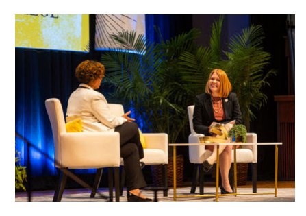
April 14, 2023